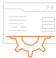
Software and Plugin Updates