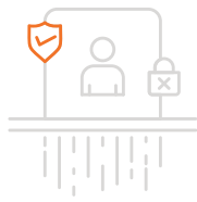
Enhanced User Experience