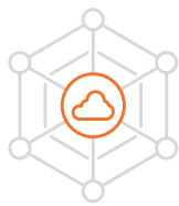
Disaster Recovery and Back-ups