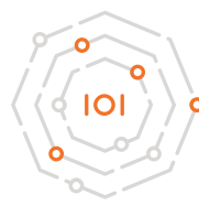
Increased Website Traffic