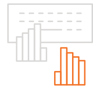
Search Engine Optimization (SEO)