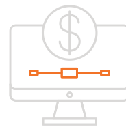
Minimized Risk of Costly Disasters